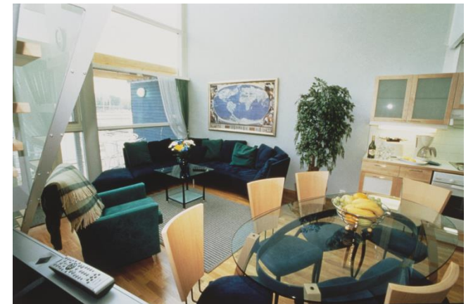
Example on 2BR apartment