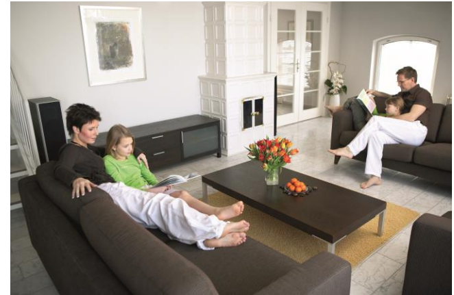
Example on 2BR apartment

Rates incl. linen, towels, after-departure cleaning