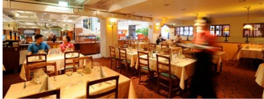
ARTHUR Breakfast restaurant serving also lunches and dinners.

Holiday Club Tampereen Kylpylä restaurants: