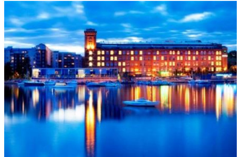
Main building by the lake

Versatile conference facilities for 8-150 pax