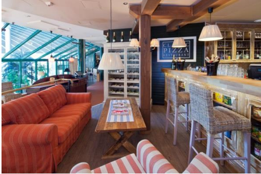
CLASSIC PIZZA a chain of Finnish family business founded 15 years ago.