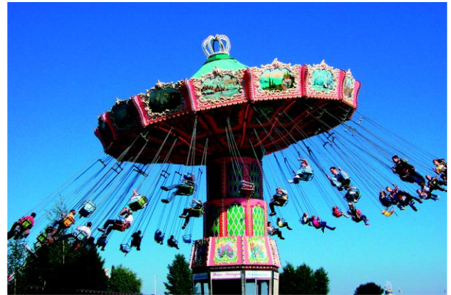
Särkänniemi amusement park